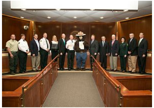
Pam Bondi, Florida Governor Rick Scott, and other state officials